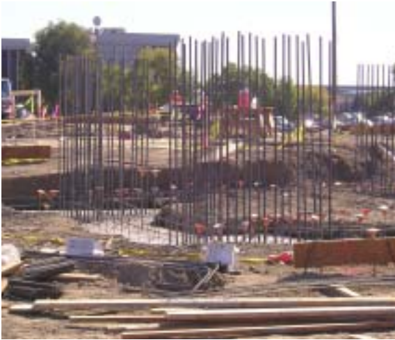
Figure 1 Concrete Placement of Footing behind Home Plate in Ballpark