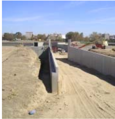
Figure 2 Ramp in Ballpark