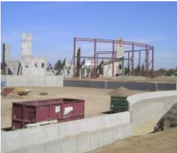
Figure 3 Field Retaining Wall in Ballpark