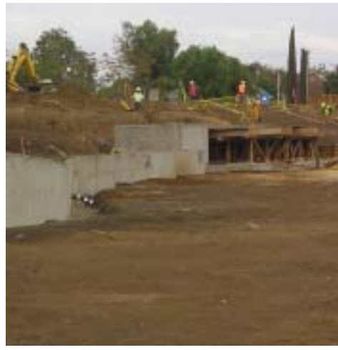
Figure 4 Left Field Dugout in Ballpark