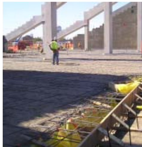
Figure 6 Preparation for Slab-On-Grade at North Side of Arena