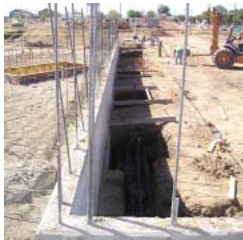
Figure 5 Wall between Loading Dock and Parking Garage in Arena