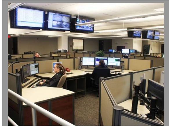
SPD Telecommunications Center

If the public does not report crime or suspicious activity, the Police Department won't know about it; and even if it is an issue that does not generate a police response, reported information helps us track trends so we can be more strategic in the way we police. If crimes are not properly reported, we do not have a true or accurate picture of crime in our community. When crimes are reported, we can better identify crime patterns and those responsible for the crime. Always remember that you can remain anonymous when reporting crimes or suspicious activity, and we do not inquire about immigration status. There are many ways to report crime or activity to the Police Department.