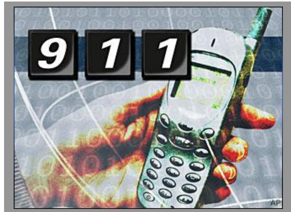
9-1-1 is for Emergencies Only

Crime Stoppers: This is a non-profit reward program that gives cash rewards of up to $10,000 to help solve crimes. Visit www.stocktongov.com and click "Police," "Programs," and then "Crime Stoppers," or call (209) 946-0600.